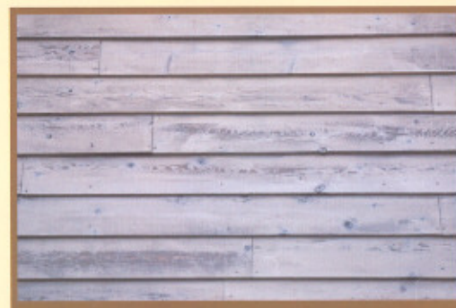
Cedar – A lifetime of maintenance.