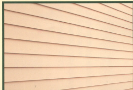
CraneBoard – Straight, beautiful and maintenance-free.