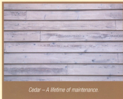
Cedar – A lifetime of maintenance.