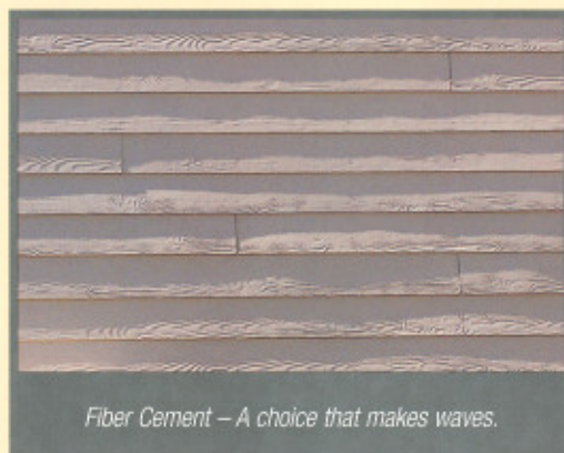
Fiber Cement – A choice that makes waves.