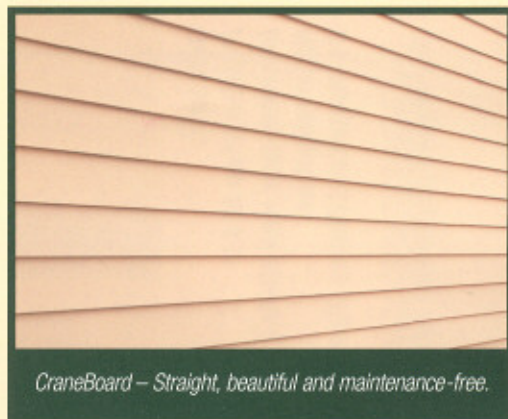
CraneBoard – Straight, beautiful and maintenance-free.